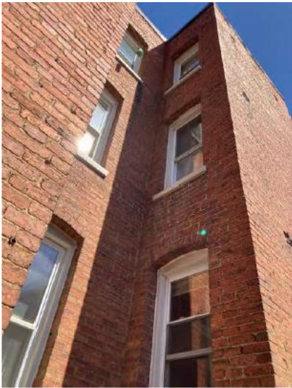
747 10 TH STREET SE